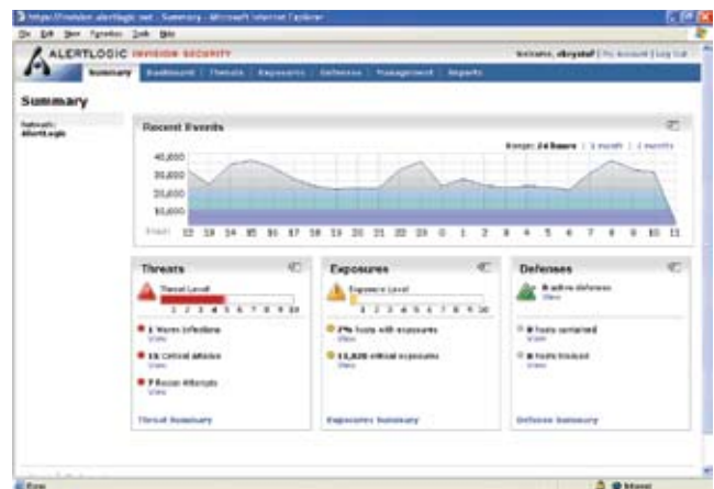
Alert Logic Threat Manager helps identify threats and remediate network and host vulnerabilities before they can impact your business.

Alert Logic's Threat Manager solution offers the easiest way to comply with regulations and protect your internal network from attack. Threat Manager is designed to provide a critical layer of network defense against threats that easily bypass perimeter and endpoint defenses – constantly protecting your internal network from viruses, worms, and other threats brought in by roaming laptops, VPN connections, wireless access points, partner portals, and other supposedly "trusted" sources.