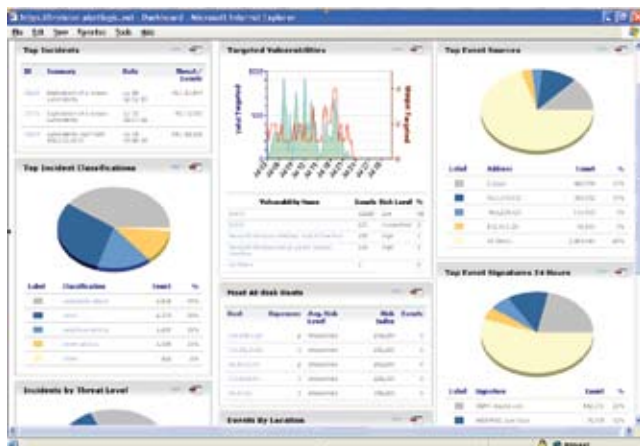
Alert Logic Threat Manager delivers a critical layer of internal network protection, preventing worms, botnets, Trojans, and other malicious intruders from propagating throughout your network.

Threat Manager combines intrusion protection and vulnerability management technology into a single integrated solution that offers both proactive and reactive protection from the latest threats. Threat Manager's unique on-demand architecture eliminates the false alarms typically associated with intrusion detection technology. All of the alerts from our network appliance are fed directly into a centralized expert system hosted in our datacenter. The expert system correlates the IDS alert data with vulnerability data and real-time threat trend information from all Alert Logic customers worldwide, and identifies only valid security incidents that threaten your network – something a traditional standalone appliance simply cannot accomplish.